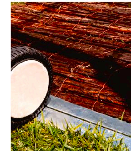
Low threshold ramp