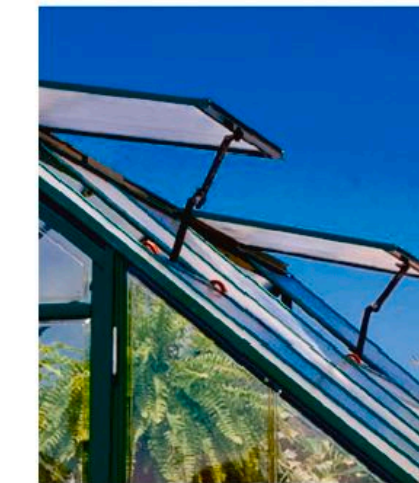
2 vent windows included